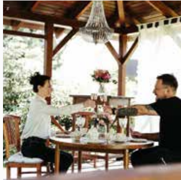
Mlýn vodníka Slámy