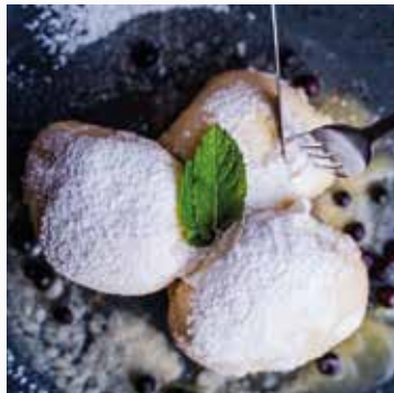
Restaurant – Bar Kopřivná

La Petite Conversation Winestone (Mercure Ostrava Center Hotel) Restaurant Imrvére Restaurant Miura Nha Cretcheu Café & Restaurant Rest&rt restaurant & bar