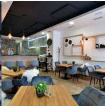
REST&RT – restaurant & bar